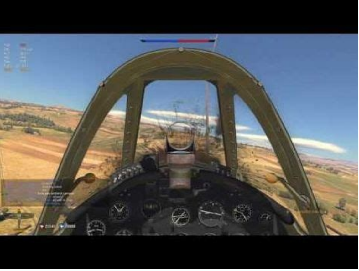
War thunder tips and tricks. Hacks for war thunder. Can you cheat in war thunder.