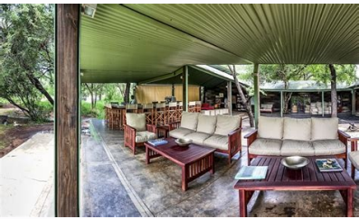
Honeyguide tented safari camp mantobeni.